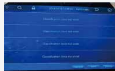
Single version (standard)

An accurate stored items management system was developed for users who don't use freezer racks, boxes and vials, the system easily records the items locations, entry and exit records and largely facilitate item inventory and statistics.