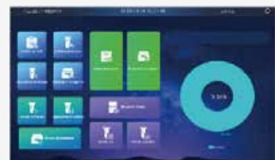
Professional version (optional)

The stored item management system was developed for users who use freezer racks, boxes and vials, the system can easily record the item locations, entry and exit records, facilitate item inventory and statistics with multi-screen interaction and reduce errors through secondary verification.